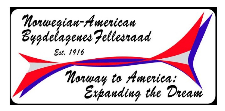
2024 Fellesraad Annual Meeting The theme for the 2024 Annual meeting was: "Crossings 2025"

Friday, 3 May (Hybrid Meeting on Zoom & In-Person):